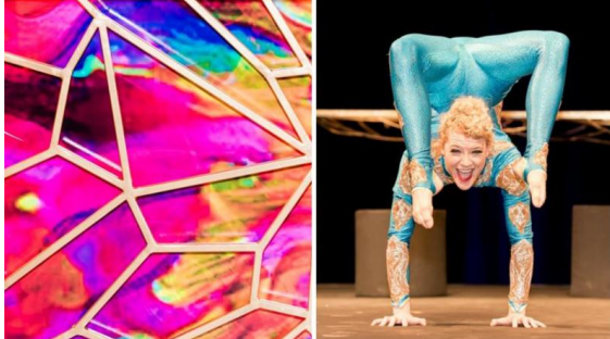
2019 EEA PHOTOS: Red Carpet & Candid Photos

Services: Consultants-Business Management, Finance, Strategic Planning/Publications & Reference