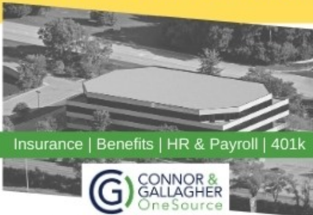
CGO is located in Lisle, Illinois

TO OBTAIN A QUOTE CONTACT CONNOR & GALLAGHER ONESOURCE (CGO), ONE OF OUR PREFERRED INSURANCE BROKER PARTNERS.